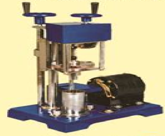
Vane Shear Test