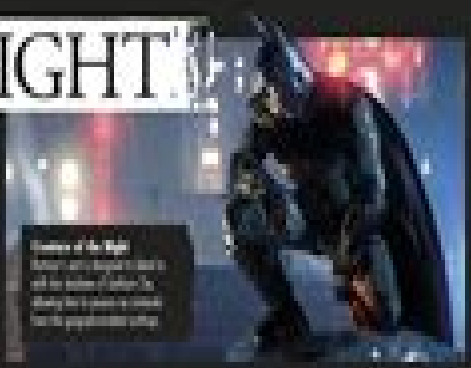
Colors of the Night Bruce's iconic appearance is all in shades of black, fitting his persona as the "dark knight."

Even Bruce decided to dedicate his life to protecting the innocent. However, he was still young for Gotham City, so he stayed and that he could have volunteered to work at the police station to gain, instead of growing a criminal mind, to his education. He was excited to begin a career and so when he believed that he couldn't afford to be a cop, he had to create his own. With the immense technological resources of Wayne's fortune, he knew he could make a difference.