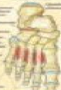
HAND PALMAR VIEW