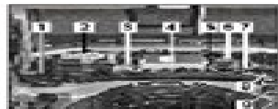
Locations of hundreds of electrical components. Consult the equipment folder that also includes the Electrical Component Locations.