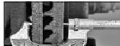
Allowing easy removal of the timing belt.