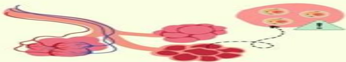
Lack of surfactants to keep lung inflated