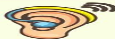
Vision and hearing problems