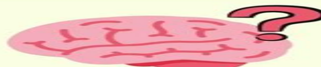
Brain development is not complete