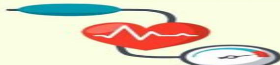
Low blood pressure reduces oxygen supply to organs