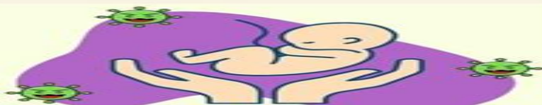
Underdeveloped immune system