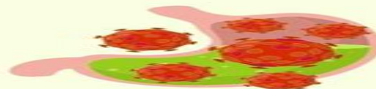
Risk of digestive problems and necrotizing enterocolitis