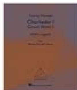
Fanny Hensel Choralieder Vol. 1 HL00373820