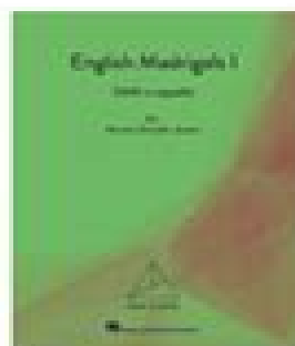
English Madrigals Vol 1 HL00373820