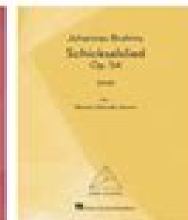
Johannes Brahms Schicksalslied HL00373822