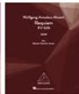
W.A.Mozart Requiem HL00392322