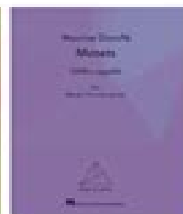
Maurice Durufle Motets HL00373821