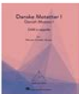
Danish Motets Vol 1 HL00390944