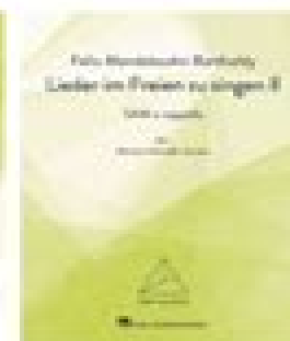
Felix Mendelssohn Lieder im Freien zu singen Vol. 2 HL00392322