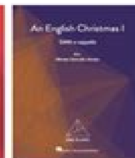
An English Christmas Vol 1 HL00373822