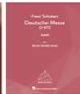
Franz Schubert Deutsche Messe HL00373819