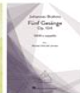
Johannes Brahms Fünf Gesänge/Five Songs Op. 104 HL00373819