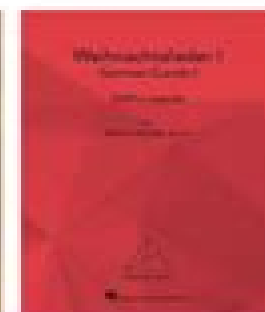
A German Christmas Vol 1 HL00373819