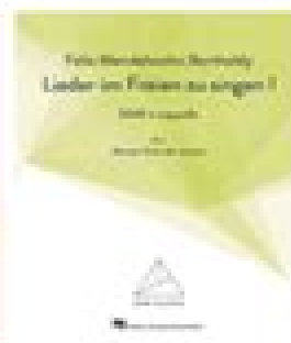
Felix Mendelssohn Lieder im Freien zu singen Vol. 1 HL00373821