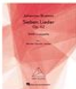
Johannes Brahms Sieben Lieder Op. 62 HL00390944