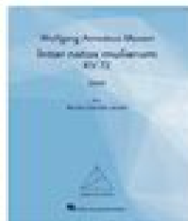
W.A.Mozart Inter natos mulierum HL00373820