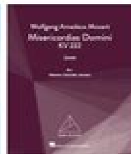
W.A.Mozart Misericordias Domini HL00373821