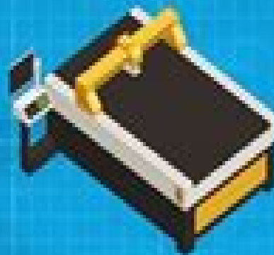
• Laser Cutters