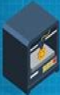
• 3D Printers