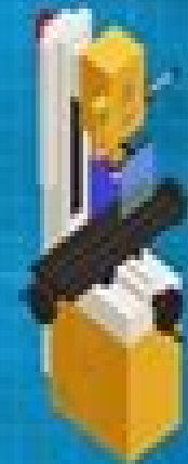
• Milling Machines