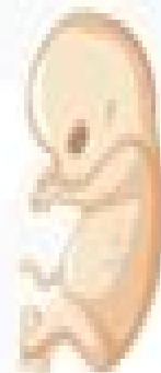
FOETUS (20 WEEKS)