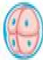
4- CELL STAGE