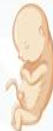
FOETUS (40 WEEKS)