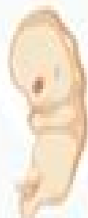
FOETUS (10 WEEKS)