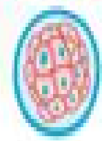
16- CELL STAGE