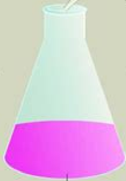
Sodiumhydroxide + Phenolphthalein