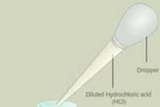
Diluted Hydrochloric acid (HCl)