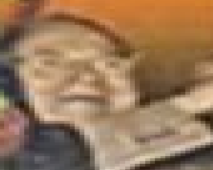
The Pathology of Mathematics