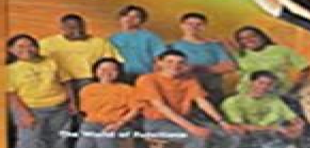
The World of Learners