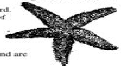
Fig 1 - Aboral Surface