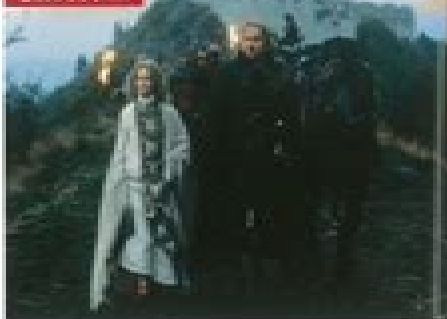
Illustrations by film-makers create the medieval world in their films.

The introduction on the previous page explains the terms 'medieval' and 'medieval Europe'. The timeline on the previous page and the following map will make this information clearer.