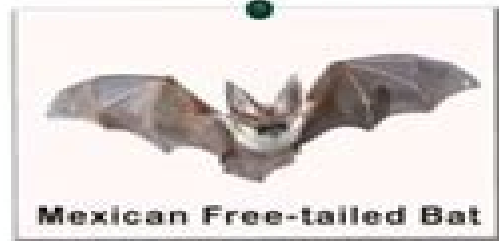
Mexican Free-tailed Bat