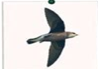
White-Throated Needletail Swift