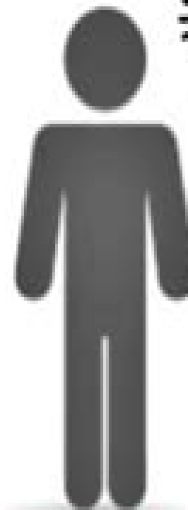
How an individual