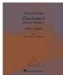
Fanny Hensel Choralieder Vol. 1 HL00373820