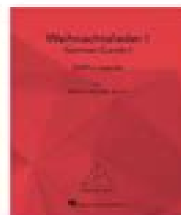
A German Christmas Vol 1 HL00373819