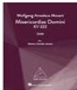
W.A.Mozart Misericordias Domini HL00373821