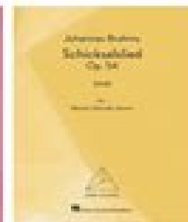
Johannes Brahms Schicksalslied HL00373822