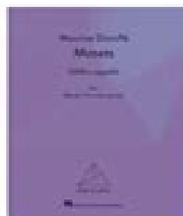
Maurice Durufle Motets HL00373821