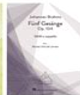
Johannes Brahms Fünf Gesänge/Five Songs Op. 104 HL00373819