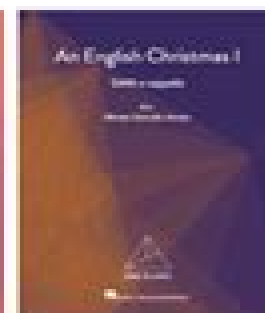
An English Christmas Vol 1 HL00373822