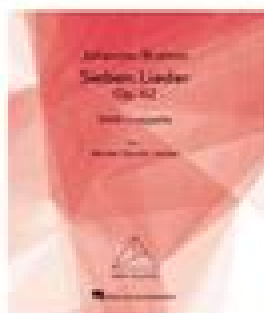
Johannes Brahms Sieben Lieder Op. 62 HL00390944