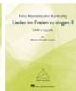
Felix Mendelssohn Lieder im Freien zu singen Vol. 2 HL00392322