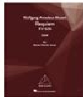
W.A.Mozart Requiem HL00392322