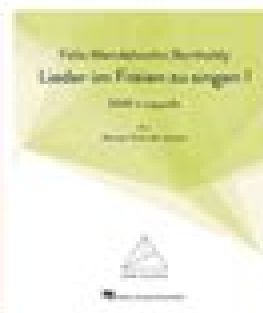
Felix Mendelssohn Bartholdy Lieder im Freien zu singen Vol. 1 HL00373821