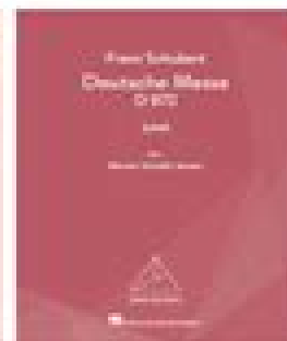
Franz Schubert Deutsche Messe HL00373819