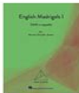
English Madrigals Vol 1 HL00373820