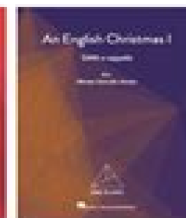
An English Christmas Vol 1 HL00373822