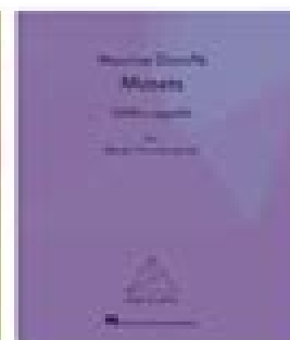
Maurice Durufle Motets HL00373821