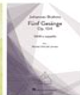
Johannes Brahms Fünf Gesänge/Five Songs Op. 104 HL00373819