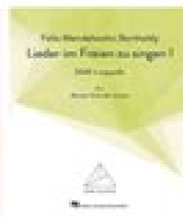
Felix Mendelssohn Lieder im Freien zu singen Vol. 1 HL00373821