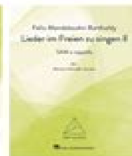
Felix Mendelssohn Lieder im Freien zu singen Vol. 2 HL00392322