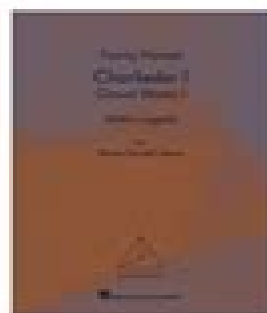
Fanny Hensel Choralieder Vol. 1 HL00373820