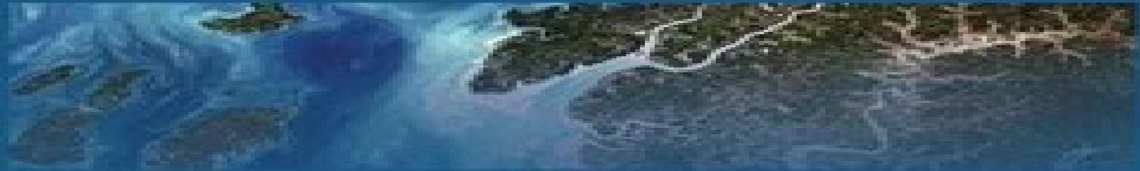
PHOTO GEOLOGY AND REMOTE SENSING