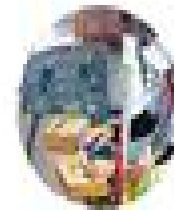
Delivery & Packing