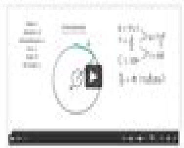
Figure 1 1 of 1

Click here to watch a video that walks through the geometry of circles, including a worked-out example. Then answer the questions that follow.