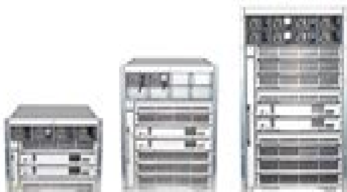
4-slot to 10-slot chassis