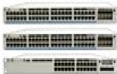
C9300-48UN C9300-48UXM C9300-24UX