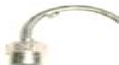
OLS - 645 Pipe Swan Neck