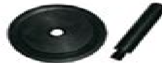
OLS - 638 Engine Rear Seal Replacer