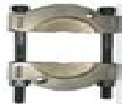
OLS - 629 Pulling Attachment