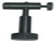
OLS - 636 Fork Shift Ball Replacer