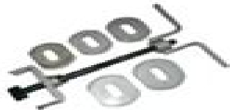
OLS - 637 Cylinder Sleeve Puller