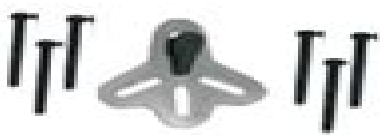
OLS - 628 Adjustable Bridge Puller