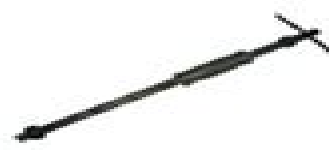
OLS - 630 Pulling Attachment