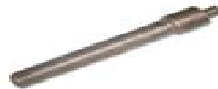
OLS - 642 Valve Stem Seal Installer