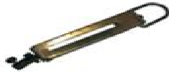
OLS - 633 Pull Scale