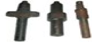
OLS - 635 Injector Dummy