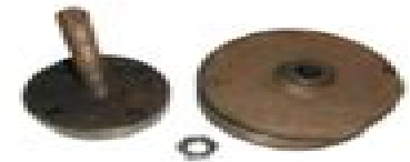
OLS - 639 Replacer Engine Rear Oil Seal