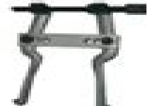
OLS - 631 Internal External Puller