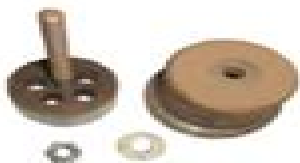
OLS - 640 Replacer Engine Front Oil Seal