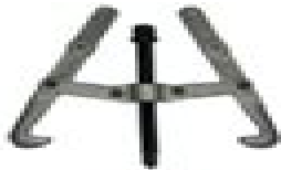
OLS - 632 Two Jaw Puller