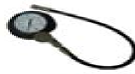
OLS - 634 Compression Gauge