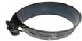
OLS - 643 Ring Compressor