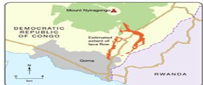
Figure 2 Lava flows towards Goma

Increased activity within the lava lake began in September 2020. On 22 nd May 2021, a major vent on the volcano's flank erupted and effusive lava began to flow at a rate of 1km per hour towards Goma, 20km away, a city of 2 million people (Figure 2). Three days later there was a Moment Magnitude (M) 5.3 earthquake and aftershocks, with some felt in Kigali, the capital of Rwanda, 90 km to the east. This raised fears of a new fissure opening on the flank. The lava flow stopped at the northern outskirts of Goma but cut off a major road connecting Goma to Beni in the north. Seismic activity stopped on 7 th June 2021. Lava was detected beneath the city and under Lake Kivu, so there were fears of a limnic reaction - the release of dissolved gases such as methane and carbon dioxide that had accumulated at the bottom of Lake Kivu.