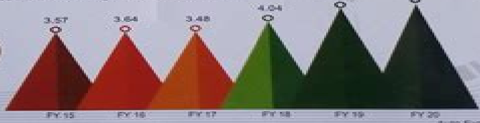
Auto Exports from India