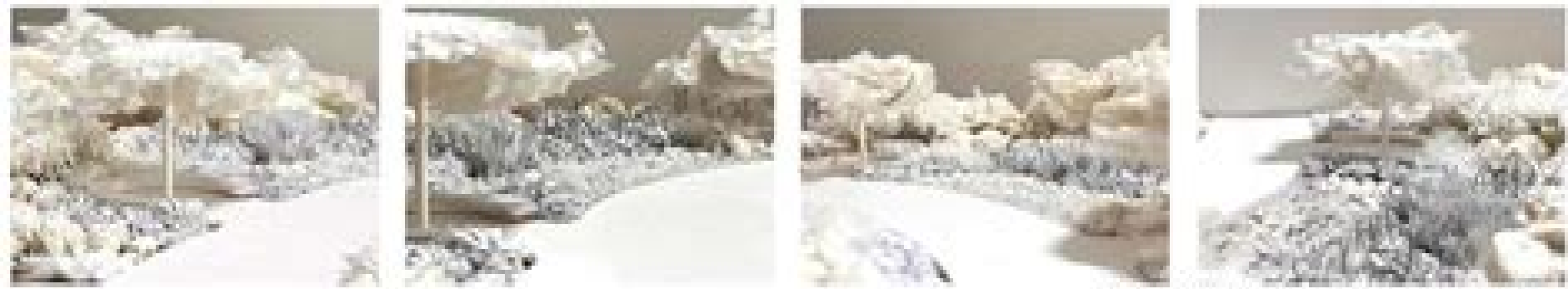
COMPOSITION EXPRESSED THROUGH MODEL