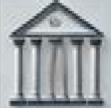
CONSTRUCTION PROJECT MANAGEMENT