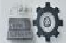
CONSTRUCTION PROJECT MANAGEMENT