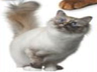
Seal Tortie Lynx Point Birman

Abyssinian Having a similar appearance with the cats of ancient Egypt, it is believed to be one of the oldest domesticated breeds.