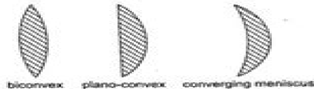
Fig. 1.1(a) Converging lenses

A lens which is thicker at its centre than at its edges converges light and is called convex or converging lens . A lens which is thicker at its edges than at its centre diverges light and is known as concave or diverging lens .