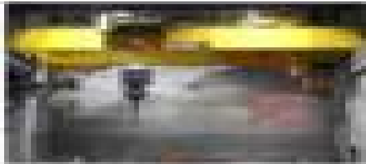
This class "T5" generating station crane is rarely used.

As to the types of cranes covered under CMMA Specification No. T5 (Top Running Bridge and Gantry Type Multiple Drive Electric Overhead Traveling Cranes), there are six (6) different classifications of cranes, each dependent on duty cycle. Within the CMMA Specification is a numerical method for determining exact crane class based on the expected load spectrum. Aside from this method, the different crane classifications, as generally described by CMMA, are as follows: