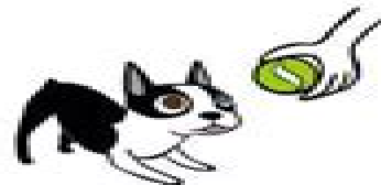
"YOU WILL FEED ME"