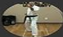
Basics (Jishu) Basic techniques such as punches, kicks, stances, and blocks.