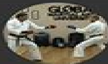
Sparring (Kumite) Sparring practice that begins with controlled one-steps, and then gradually morphs into freestyle sparring.