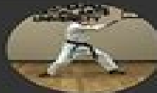
Forms (Kata) A pre-arranged fight or choreographed training sequence integrating several techniques.