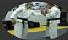
Self-Defense Sets (Goshin Jutsu) Specialized self defense techniques address chokes, holds, grabs, and weapon threats.