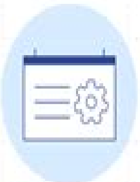
Real-time data integration