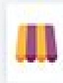
Point of Sale