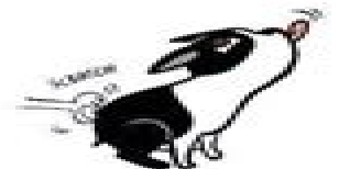
"I LOVE YOU, DON'T STOP"