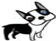
CURIOUS head tilt