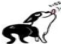
FRIENDLY & POLITE curved body