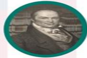
William H. Crawford