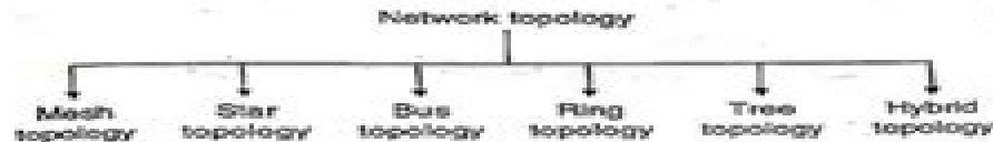
(C-140) Fig. 1.1 : Classification of network topology

The six basic network topologies are as shown in Fig. 1.1.