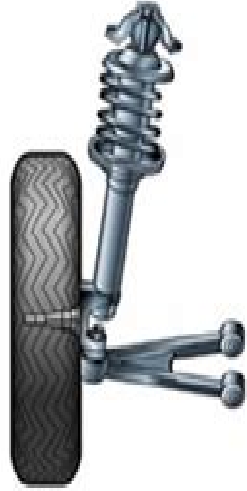
c) Practical suspension