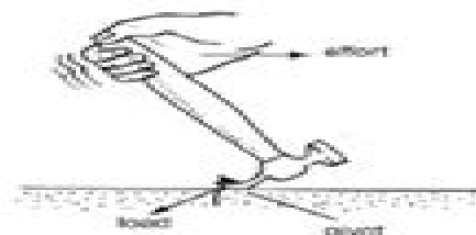
The hammer is acting as a force multiplier.