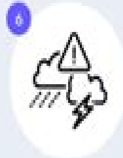
Poor Weather Conditions