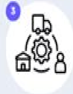
Supply Chain Delays