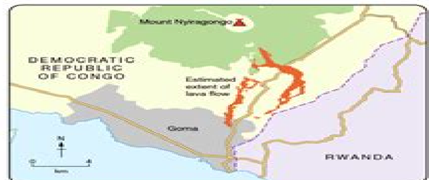
Figure 2 Lava flows towards Goma

Increased activity within the lava lake began in September 2020. On 22 nd May 2021, a major vent on the volcano's flank erupted and effusive lava began to flow at a rate of 1km per hour towards Goma, 20km away, a city of 2 million people (Figure 2). Three days later there was a Moment Magnitude (M) 5.3 earthquake and aftershocks, with some felt in Kigali, the capital of Rwanda, 90 km to the east. This raised fears of a new fissure opening on the flank. The lava flow stopped at the northern outskirts of Goma but cut off a major road connecting Goma to Beni in the north. Seismic activity stopped on 7 th June 2021. Lava was detected beneath the city and under Lake Kivu, so there were fears of a limnic reaction - the release of dissolved gases such as methane and carbon dioxide that had accumulated at the bottom of Lake Kivu.