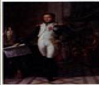
Portrait of Jean-Pierre Boyer, King of Haiti, 1820

Meanwhile, a growing population of mestizo, people of Native American and European descent, and mulattoes, people of African and European descent, were angry at being denied the status, wealth, and power that were available to white, Spanish Americans. They resented the social and ethnic structures that kept them from the lands of their ancestors. In the Caribbean region and parts of South America, leaders of colonial rebellions who worked as plantation managers for the British.