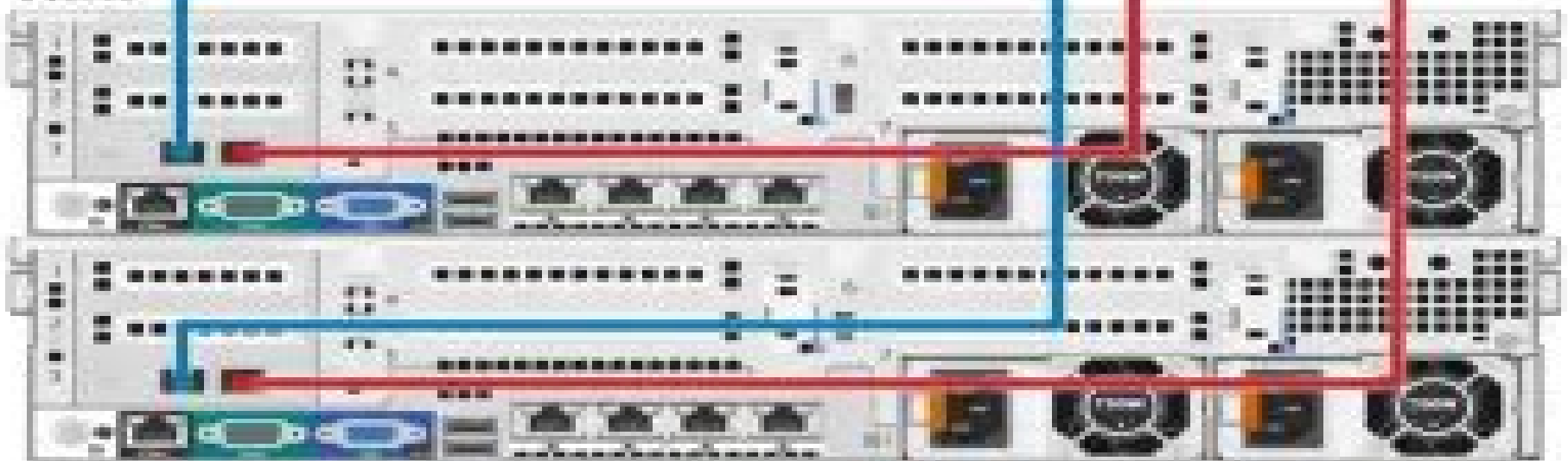
Figure 1 Cabling diagram