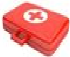
first aid kit