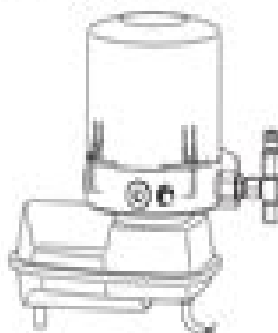
Electric pump EP 1 with 4 kg container and integrated pressure control