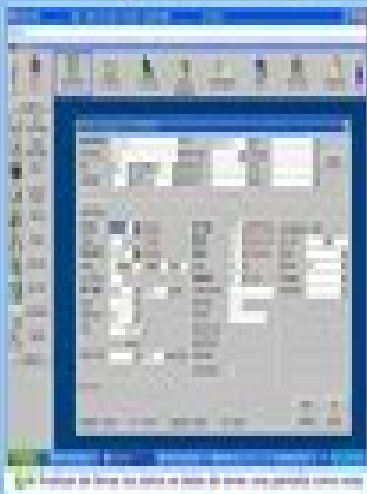
Opera browser information in Opera 10.63 (Build 10.63.0.1063)