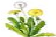
DANDELION Trustfulness, Happiness