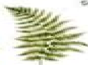
FERN Mystery, Tenderness, Confidence, Chastity