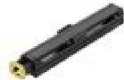
LS Single Axis Actuator Calculation Software