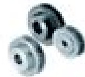
Timing Pulley Calculation Software