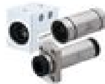
Linear Bushing Calculation Software