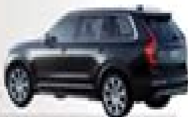
*16 Volvo XC90 AWD