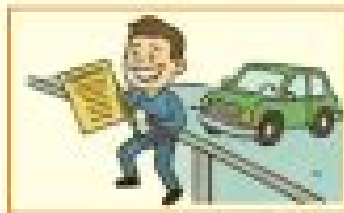
Volenti Non Fit Injuria