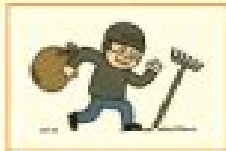
Plaintiff the Wrongdoer