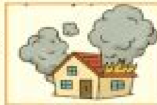
Act of God (Vis Major)