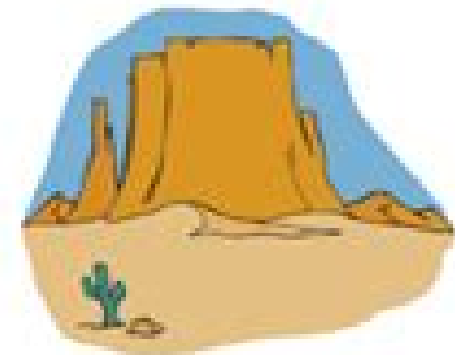
Hills / Plateau / Island