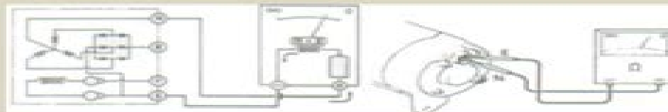
Pemeriksaan Diode Negatif