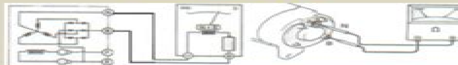
Pemeriksaan Diode Positif